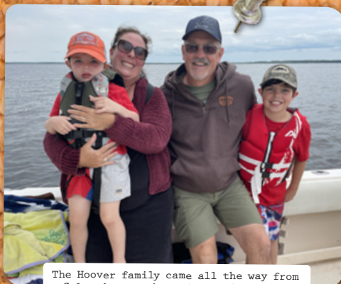
The Hoover family came all the way from Colorado to enjoy Lake of the Woods!