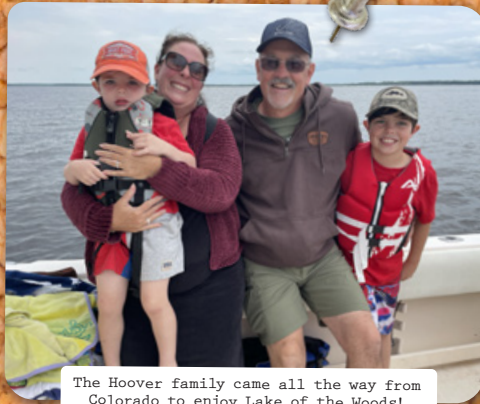
The Hoover family came all the way from Colorado to enjoy Lake of the Woods!