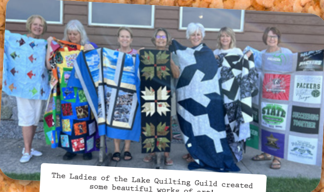
The Ladies of the Lake Quilting Guild created some beautiful works of art!