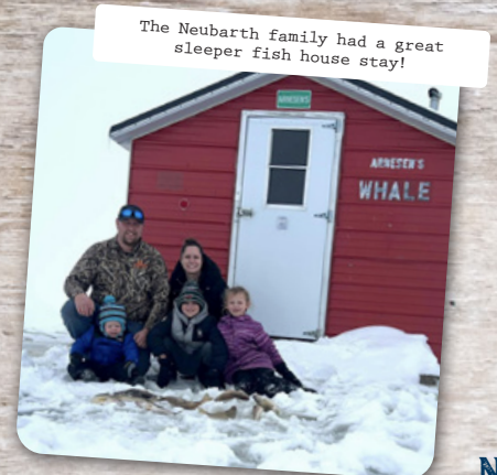
The Neubarth family had a great sleeper fish house stay!