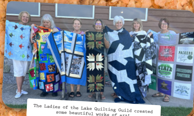
The Ladies of the Lake Quilting Guild created some beautiful works of art!