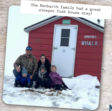
The Neubarth family had a great sleeper fish house stay!